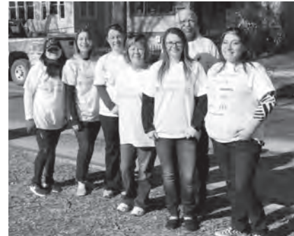
BACU employees participated in a number of events in 2017, raising funds for some very worthwhile organizations including (top) Lace Up for Diabetes on June 5, the Terry Fox Run on September 17 (left) and the West End Biz Sweep-Off on April 19.