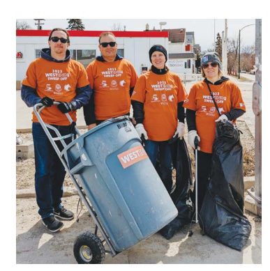
From left: BACU employees making a difference at West End Biz Sweep Off, Shred Day, Shred Day again, and Folklorama

We are proud to acknowledge this truly remarkable milestone that is such a rich part of the heritage of Belgian-Alliance Credit Union.